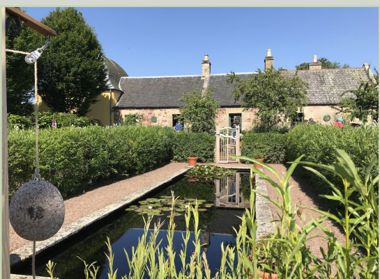
Photo credits: Edinburgh skyline ©VisitScotland; Jupiter Artland©Allan Pollock courtesy of Jupiter Artland; Abbotsford ©The Abbotsford Trust; Cawdor Castle ©VisitScotland/Kenny Lam