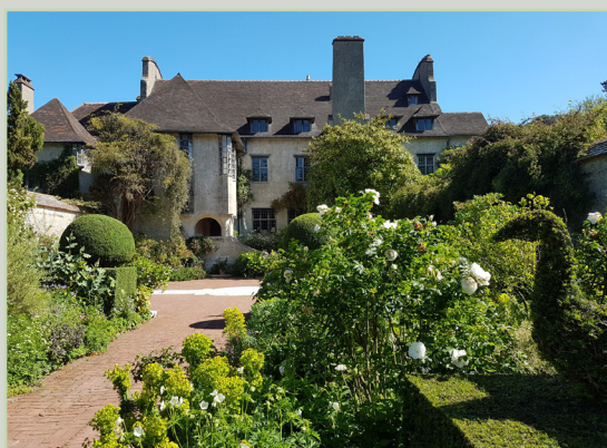
Photo credits: Giverny Thomas Le Floc; ©Château de Boutemont; Étretat ©Richard Bloom; Château du Champs de Bataille ©Bruce Kupper; Château de Miromesnil ©Château de Miromesnil; Le Bois des Moutiers and Rouen centre ©Ben Colliers.