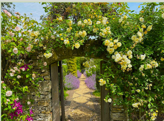
Photo credits: Morton Hall ©Clive Nichols; The Royal Gardens at Highgrove©Highgrove Enterprises.

take a stroll through the garden, ending with drinks on the terrace. We return to the hotel for dinner (included).