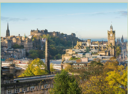
Photo credits: Edinburgh skyline, Jupiter Artland & Urquart Castle on Loch Ness ©VisitScotland; ©Abbotsford ©Durnamuck/GardensIllustrated.